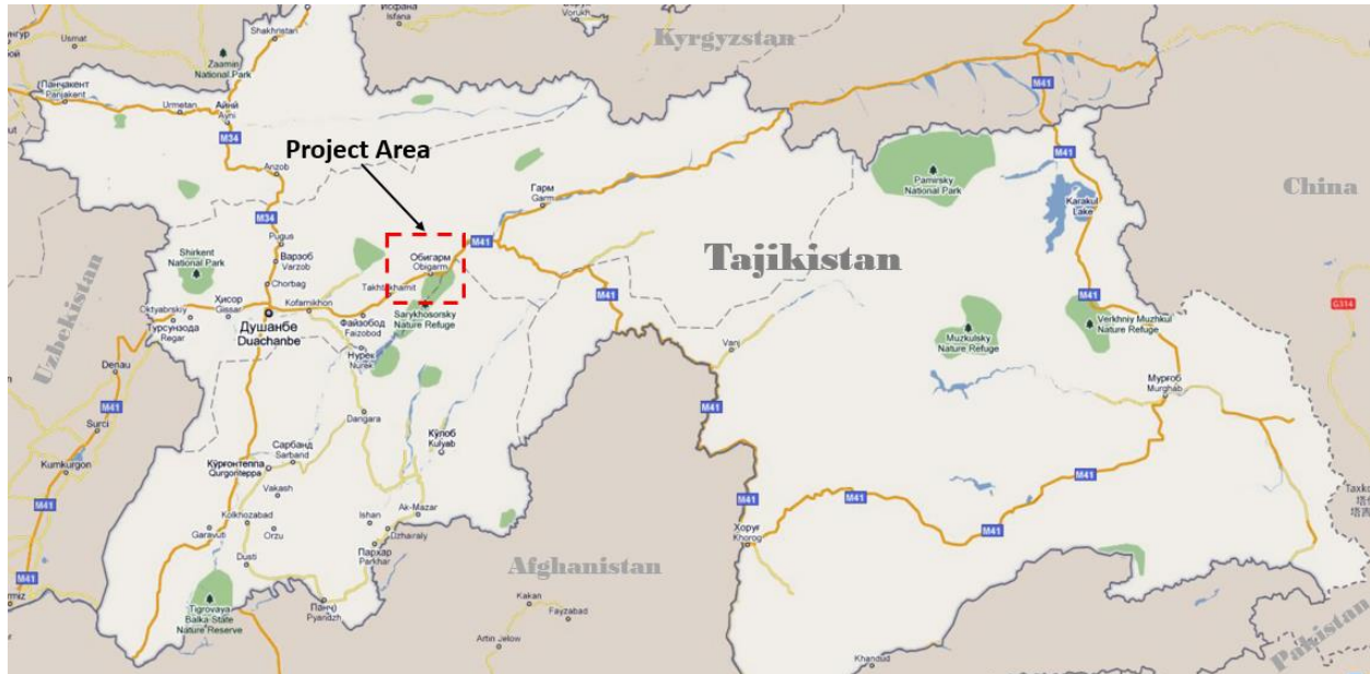
Map 1 - Project Area

Design and Procurement under Package 3 (The Project), applying Output and Performance-based Design and Build (D&B) type of contract, will be conducted in accordance with AIIB's Procurement Policy and AIIB's Interim Operational Directive on Procurement Instructions for Recipients, June 2016.